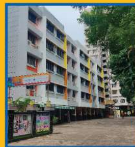
Dr. S. Radhakrishnan International School Borivali (West)