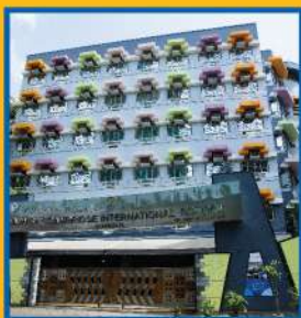
Bombay Cambridge International School Andheri (East)

77770 02163 / 77770 02159 admissions@bciswest.org www.bciswest.org