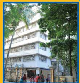
Veer Bhagat Singh International School Malad (West)