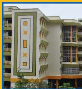
Dr. S. Radhakrishnan International School Malad (West)