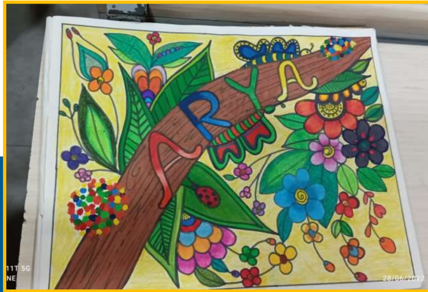
Submitted by Arya Sakpal, 7C