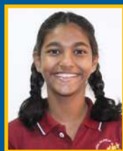
Lalsar Drishti 91.00%