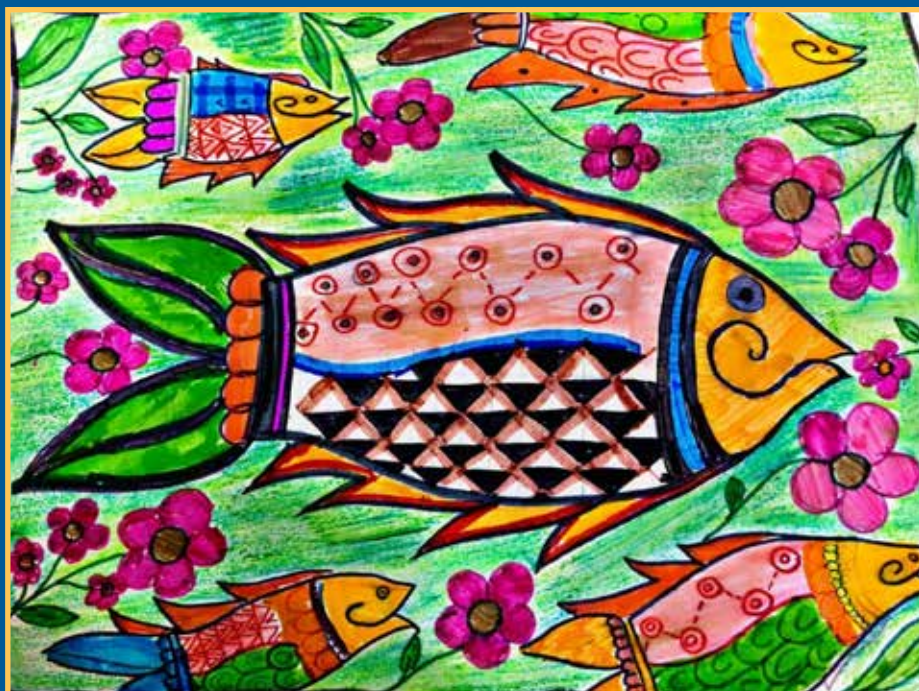
Submitted by Fatima Nagani Std. 8, BCSW